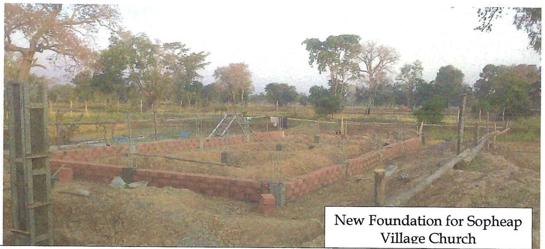
New Foundation for Sopheap Village Church