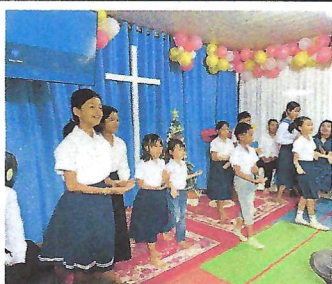
Christmas Service at Popeil Church O'dor Mean Chey

On June 4 to 6, 2024, We held 3 days of Leadership Training Institute in Battambang City with 65 leaders from Pailin, Battambang, Banteay Meanchey, O'Dor Meanchey provinces. After leadership training our leaders and I started 3 house churches, in Rumduol Chas, Chunleas Dai and Ta Bun village, Banteay Meanchey Province.