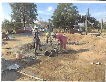
Sopheap Village Church Construction