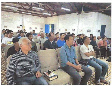
LTI at Battambang Campus