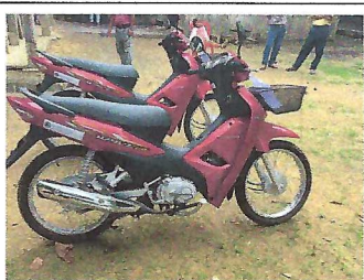
New Scooters donated to Ta Bok by Church of Pacific Kauai HI